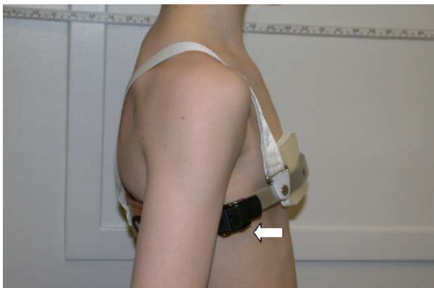
Fig. 1 Braceworks, Calgary—patient with fitted external brace, arrow showing controlled adjustable device.

Since 1998, a protocol of external bracing of PC was developed. A key element of this was redesign of the external bracing device. We moved away from the previously used scoliosis jacket to a lightweight aluminum bar with padded back support and a patient-controlled tensioning device (Fig. 1). Pectus carinatum protrusion (PCP) was measured as distance from maximal protrusion point and expected contour of chest wall. All patients with significant defects (protrusion of >2 cm) were offered bracing. After recording